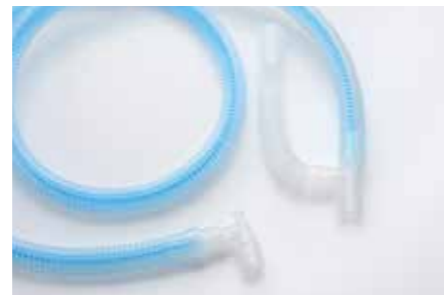
Duo Limbo Circuits